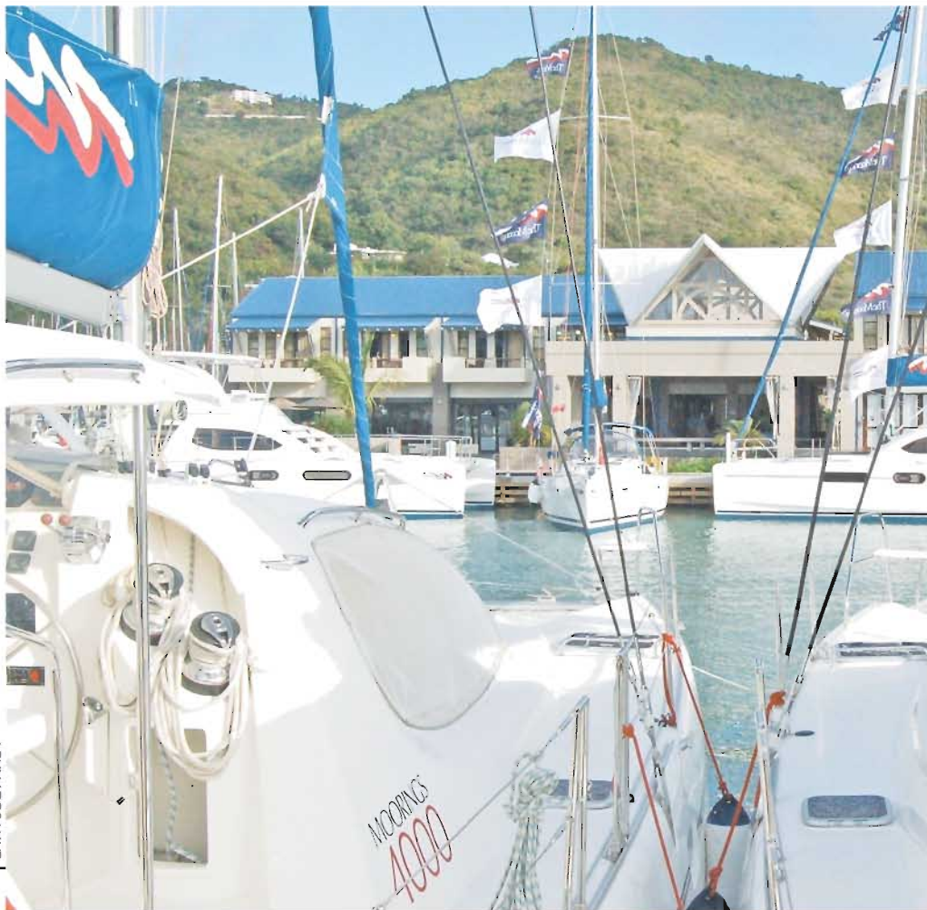
LATITUDE / ANDY

The waterside hotel is an elegant addition to Road Harbour. With construction of the new sea wall, the yacht basin seen here was created.